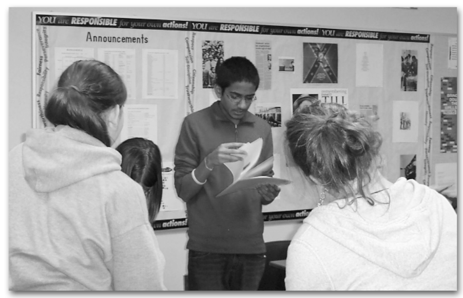
A juror studies a case at the Hazelwood Middle School Student Court in New Albany (IN)

Additional dispositions may be available to youth courts under state statutes. For example, some youth courts may be able to impose loss of driving privileges or delay in eligibility for driving privileges. These dispositions are generally ordered in cases involving drugs, alcohol, tobacco, and traffic violations.