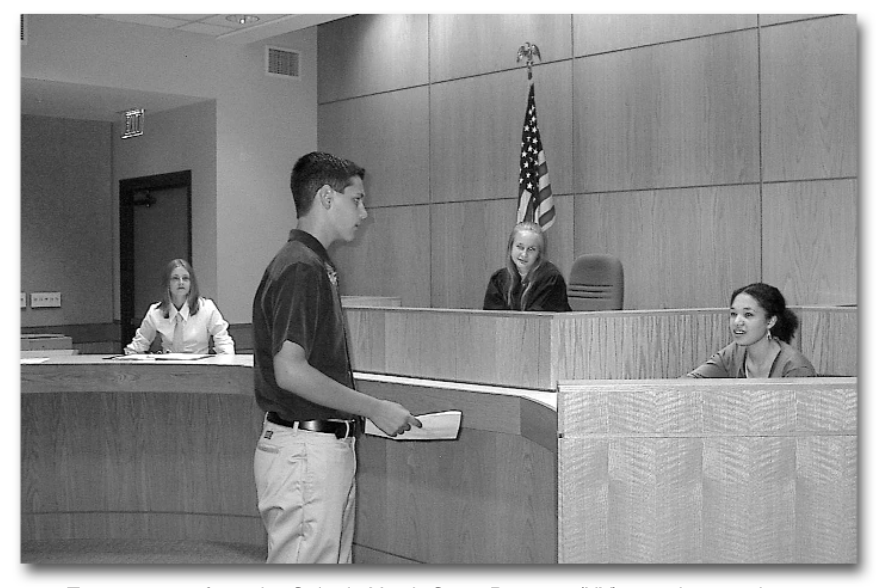
Teen attorney from the Colonie Youth Court Program (NY) questions a witness.

problems with truancy, remedial work or peer tutoring, and having the respondent tutor elementary school students. Youth courts may also order respondents to call a mentor when they wake up in the morning or to meet a mentor in school before class. Youth courts may also order youth and parents to take classes on education laws in the state.