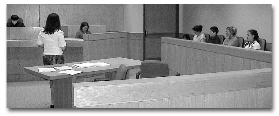
Proceedings in the Colonie Youth Court Program (NY).