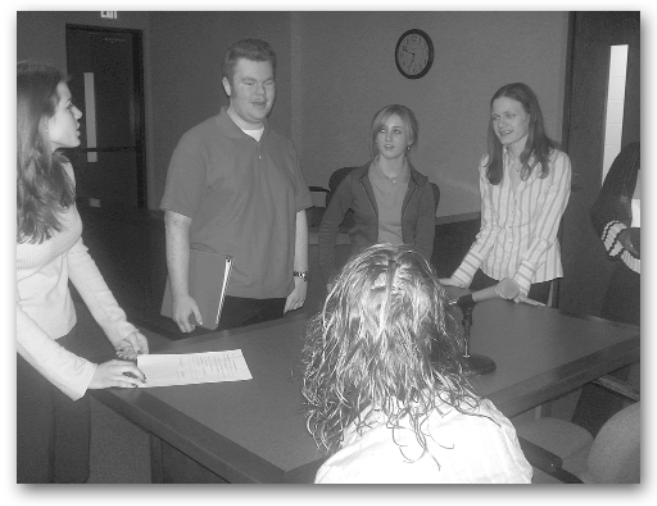
Teen jurors from the Jefferson County Teen Court (KY) deliberate.