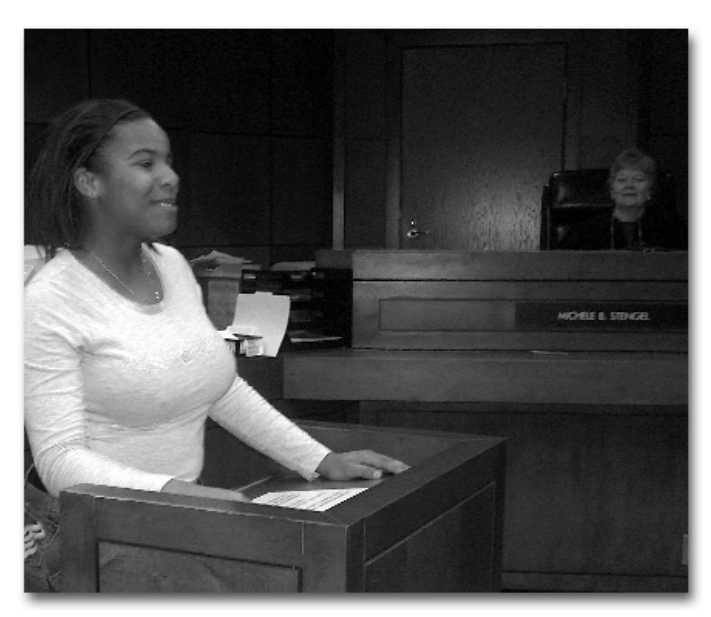
A teen attorney from Jefferson County Teen Court (KY) makes her opening statement.