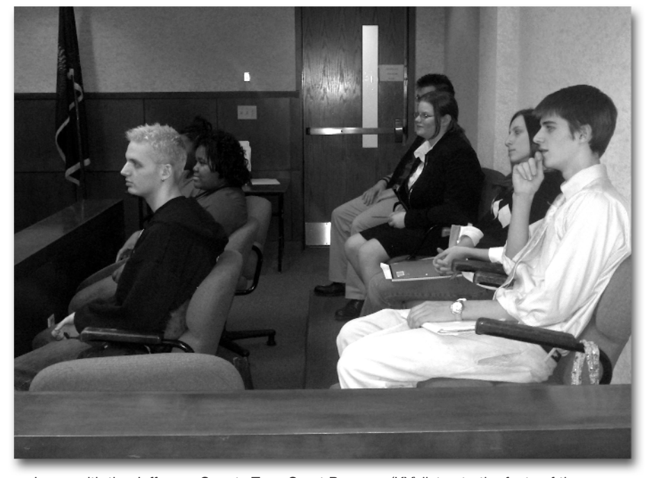
Jurors with the Jefferson County Teen Court Program (KY) listen to the facts of the case.

trauma unit; and interviewing a doctor about the types of injuries that result from reckless behavior. Youth may also be required to give speeches to younger students about the dangers of their behavior or to develop an education campaign about safe behavior.