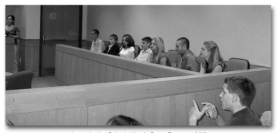
Jurors in the Colonie Youth Court Program (NY).