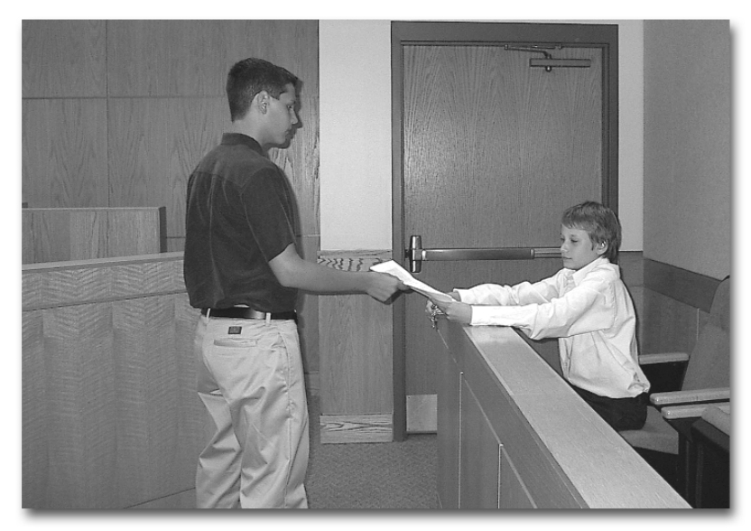
Participants in the Colonie Youth Court Program (NY).