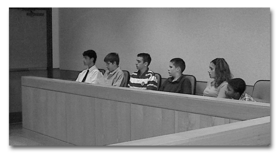
Colonie Youth Court Program (NY) jurors.

• Most regulatory cases would be acceptable in youth courts. However, as with all cases, the individual facts and circumstances should be examined to ensure that the case is appropriate.