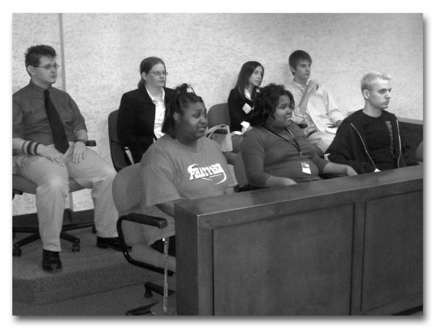
Jurors from the Jefferson County Teen Court (KY).